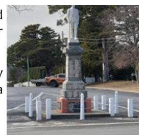
Braidwood War Memorial