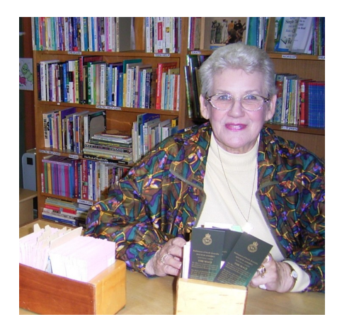
Our librarians are available to help you.

Books and other items can be returned during library hours or placed in the "Return Box" in the foyer at any time.